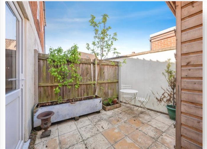
Penfold Street, Aylsham, Norwich, NR11 6ET