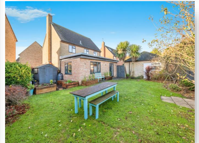
Lancaster Gardens, Aylsham, Norwich, NR11 6LB