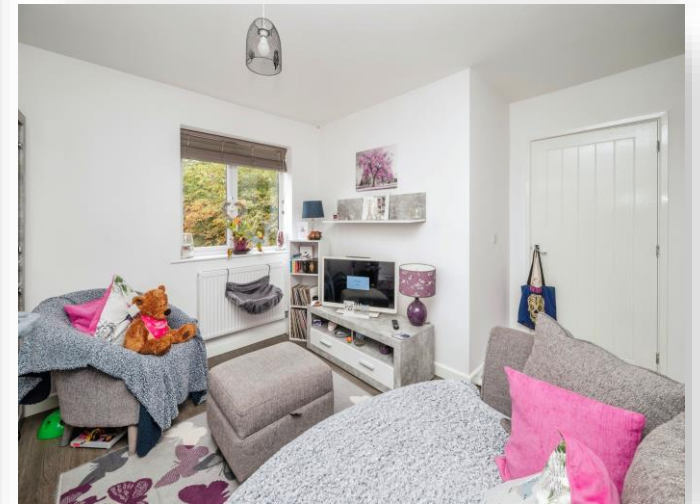
Hungate Street, Aylsham, Norwich, NR11 6JZ