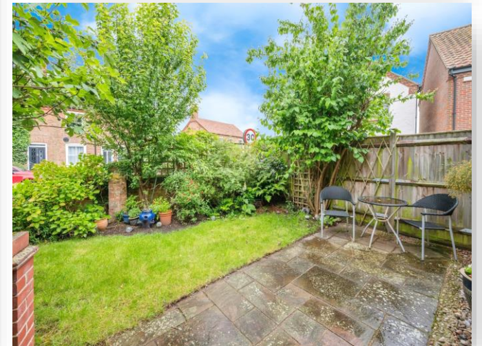
School Cottage, New Street, Cawston, Norwich, NR10 4BN