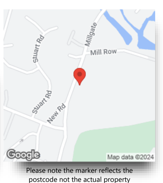
view this property online williamhbrown.co.uk/Property/AYS109499