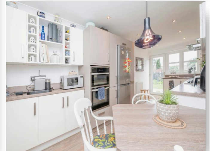
St. Marys Close, Horsham St. Faith, Norwich, NR10 3HP