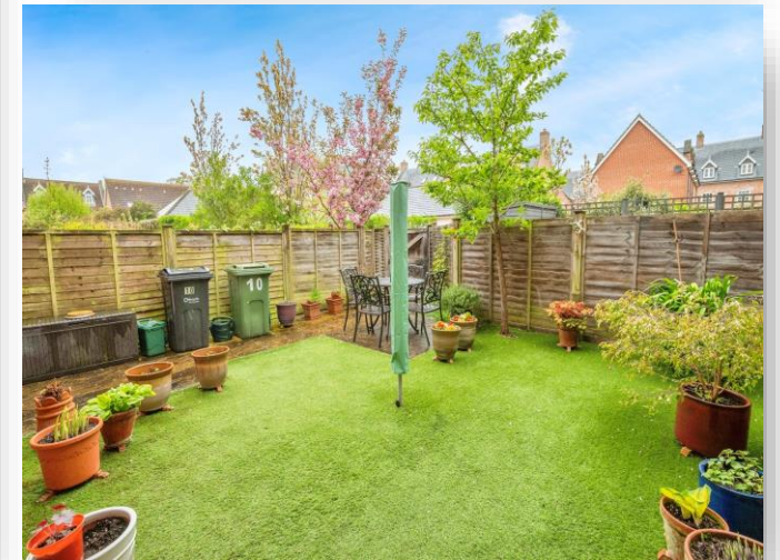
Donthorn Court, Aylsham, Norwich, NR11 6YF