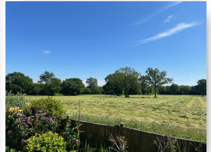
Woodland View, Stratton Strawless, Norwich, NR10 5NZ