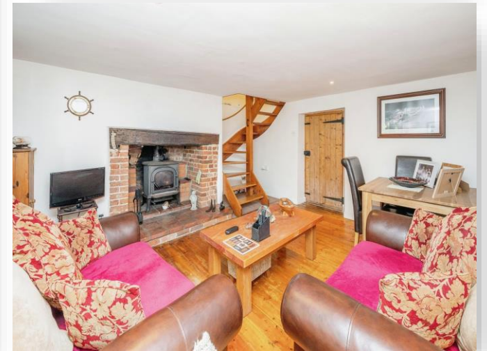
Mole End Cottage, Brook Street, Buxton, Norwich, NR10 5HF