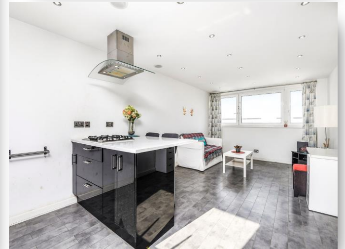
Queensdale Crescent London W11 4TW