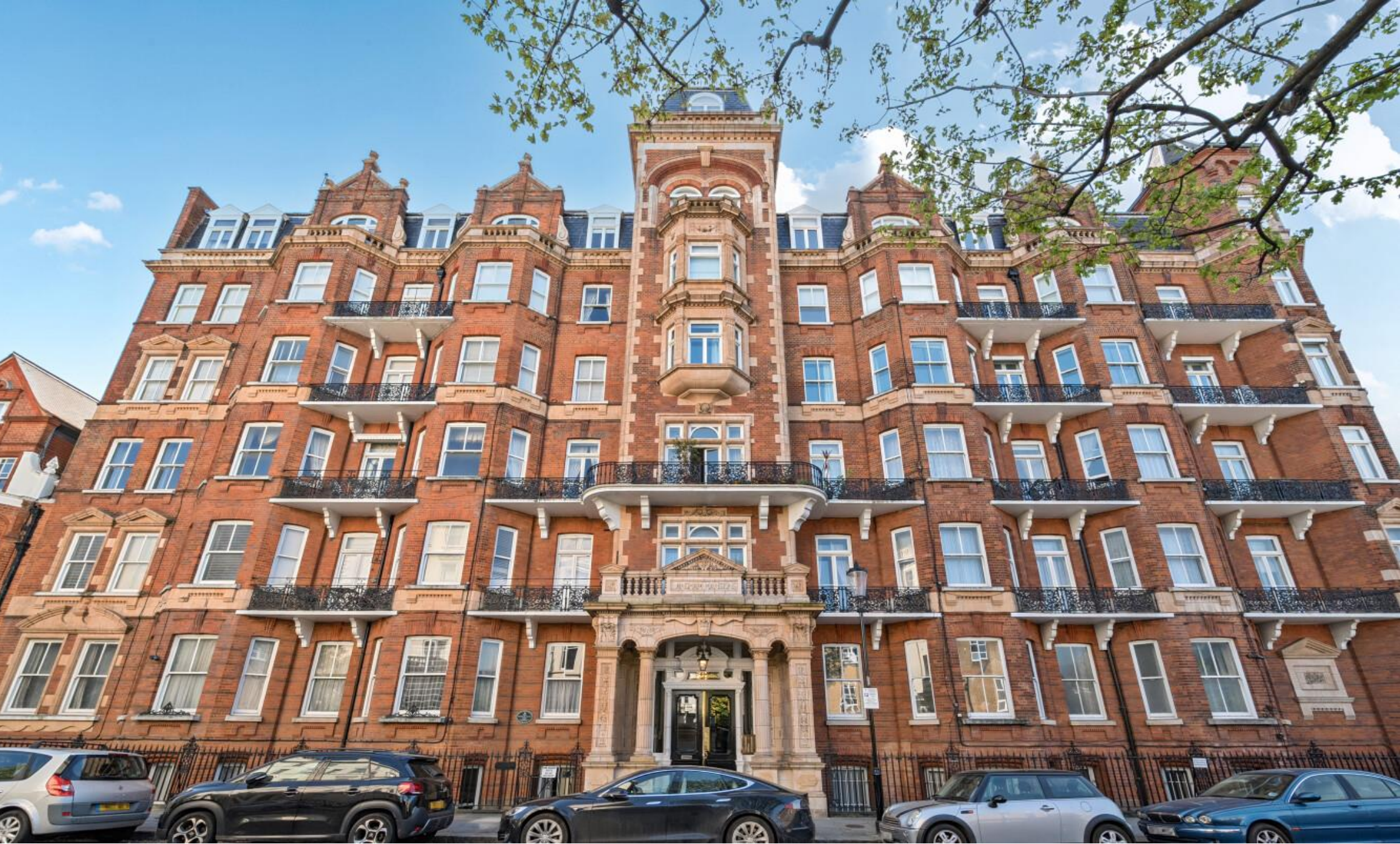
Langham Mansions Earl's Court Square, SW5

Not for marketing purposes INTERNAL USE ONLY