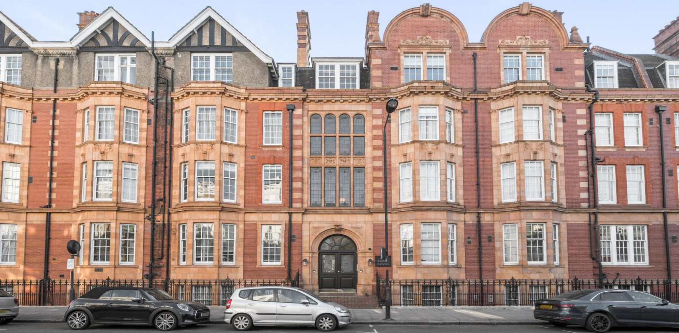
Warwick Mansions, Cromwell Crescent, London SW5 9QR