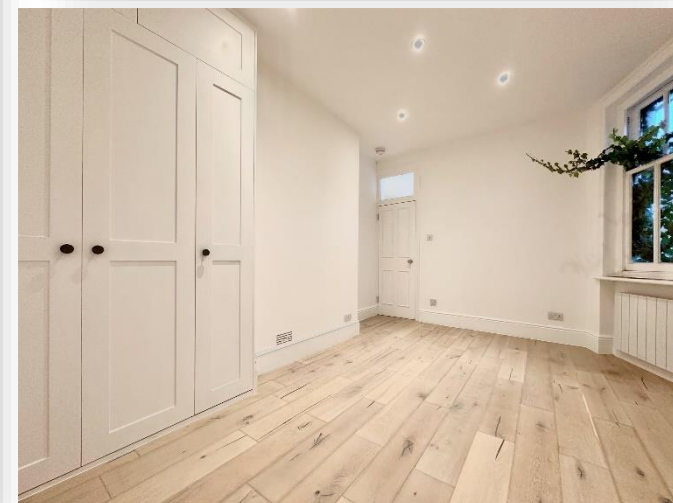
Mentone Mansions, Fulham Road, London SW10