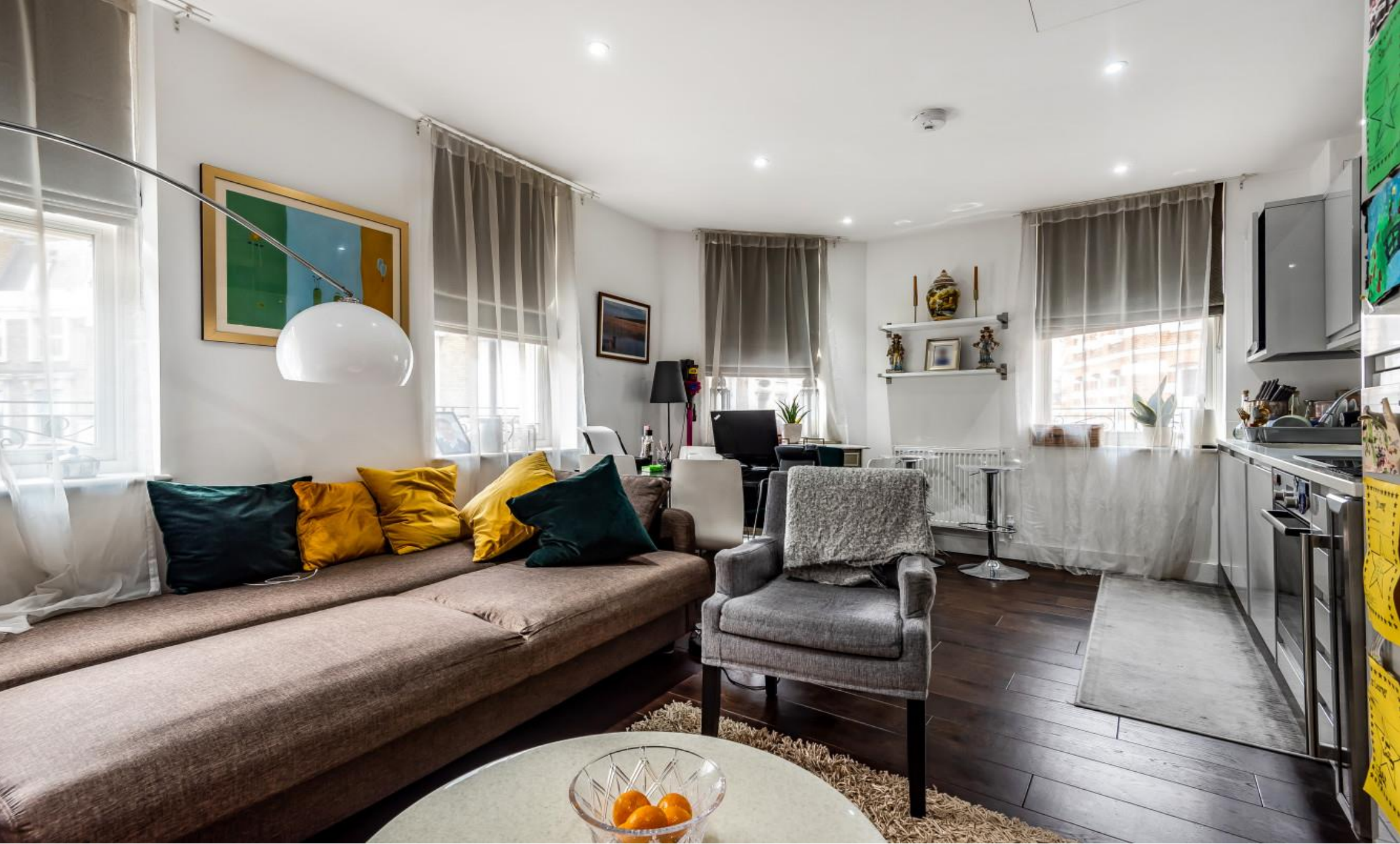
Ariana Apartments Lillie Road London SW6