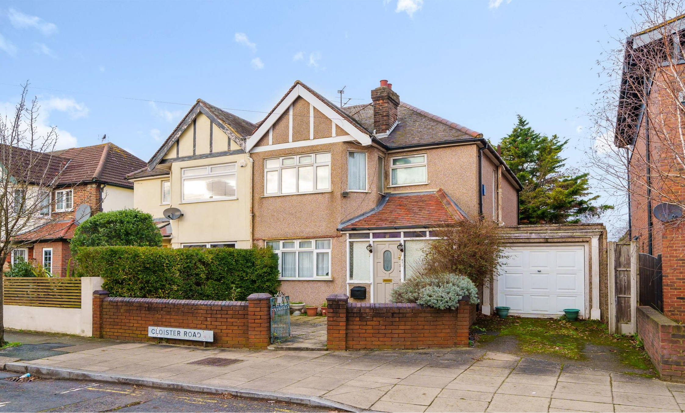
Cloister Road, London, W3 0DE