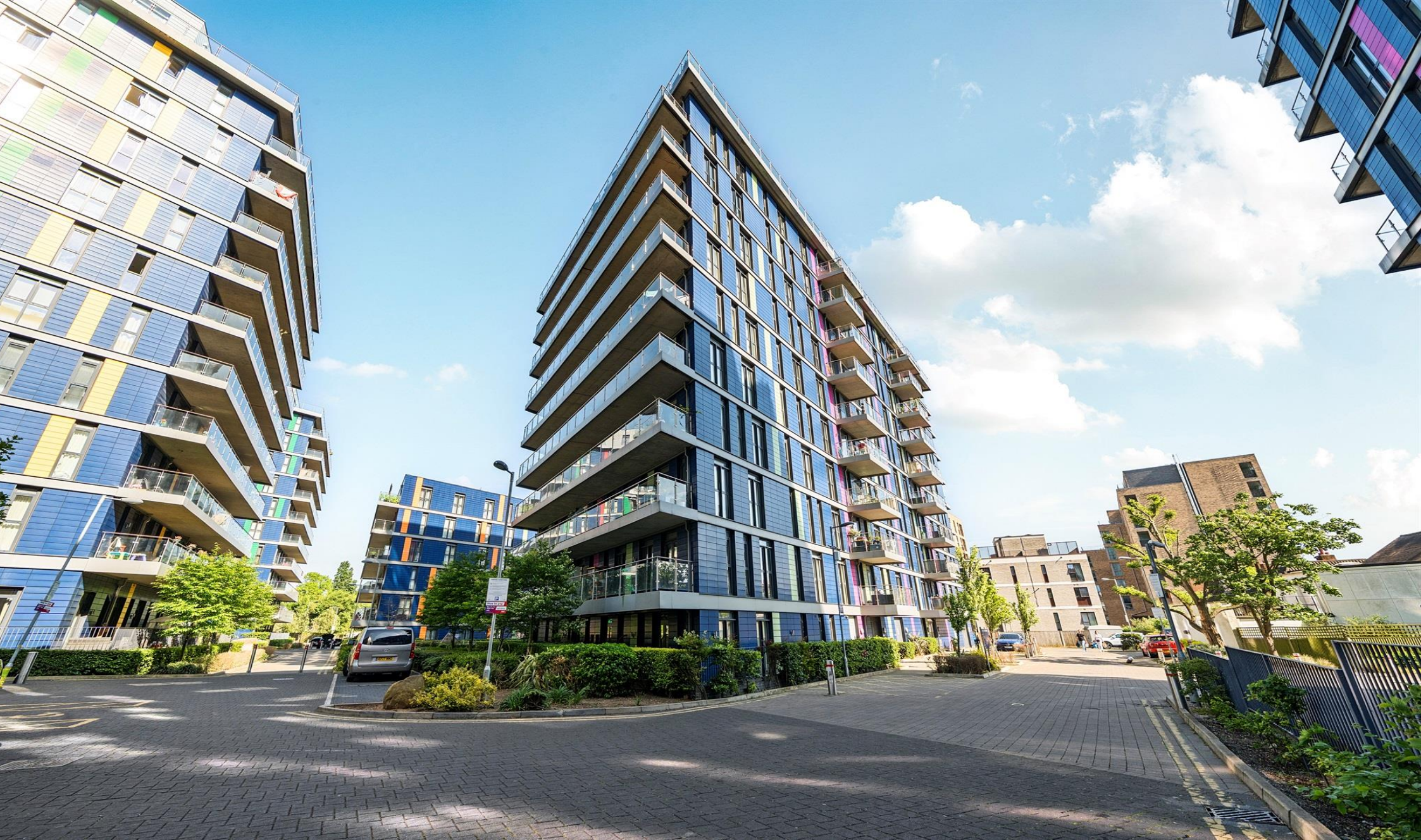
Braunston House Hatton Road, Wembley HA0 1RP