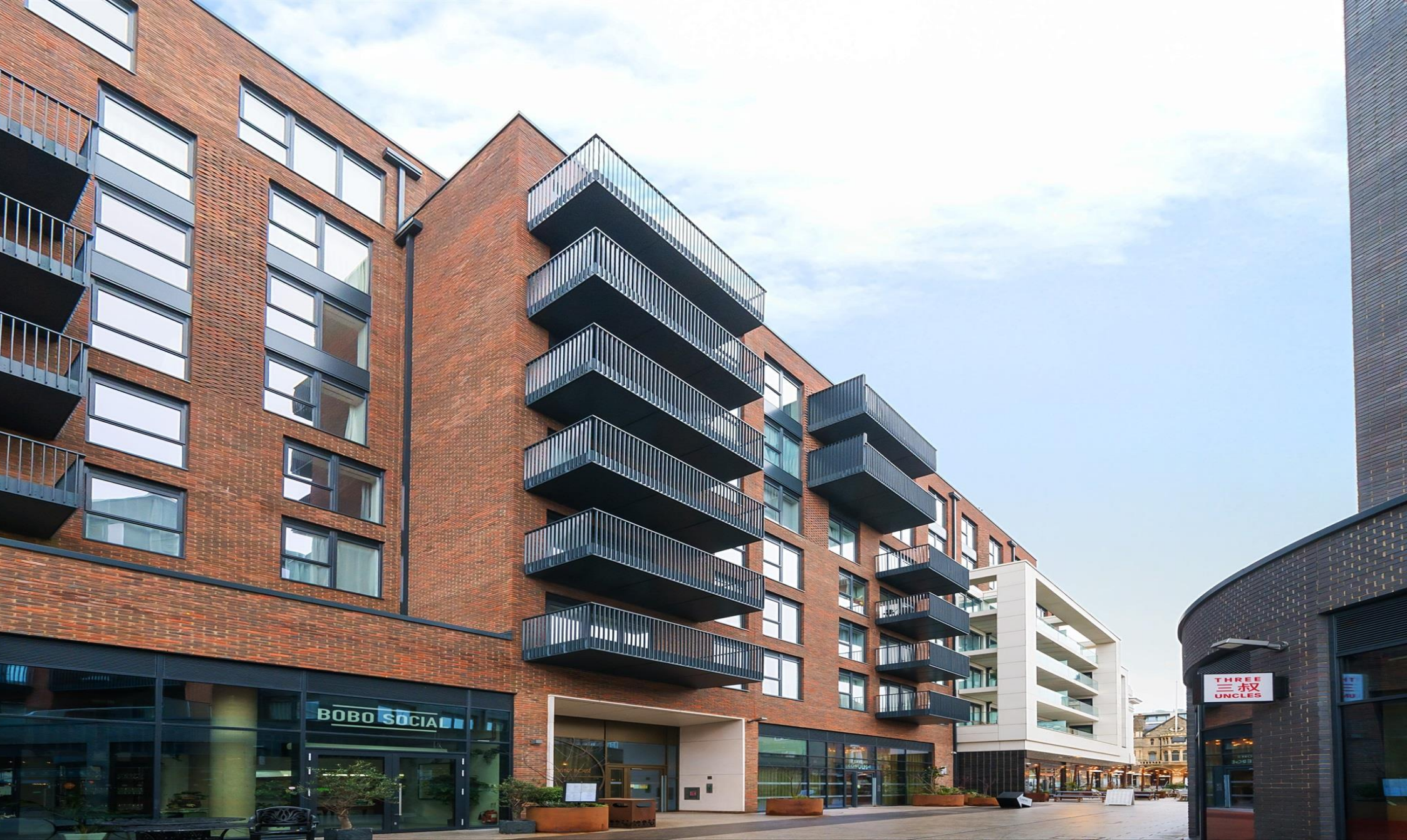
Bogart House Filmworks Walk, London W5 5BT