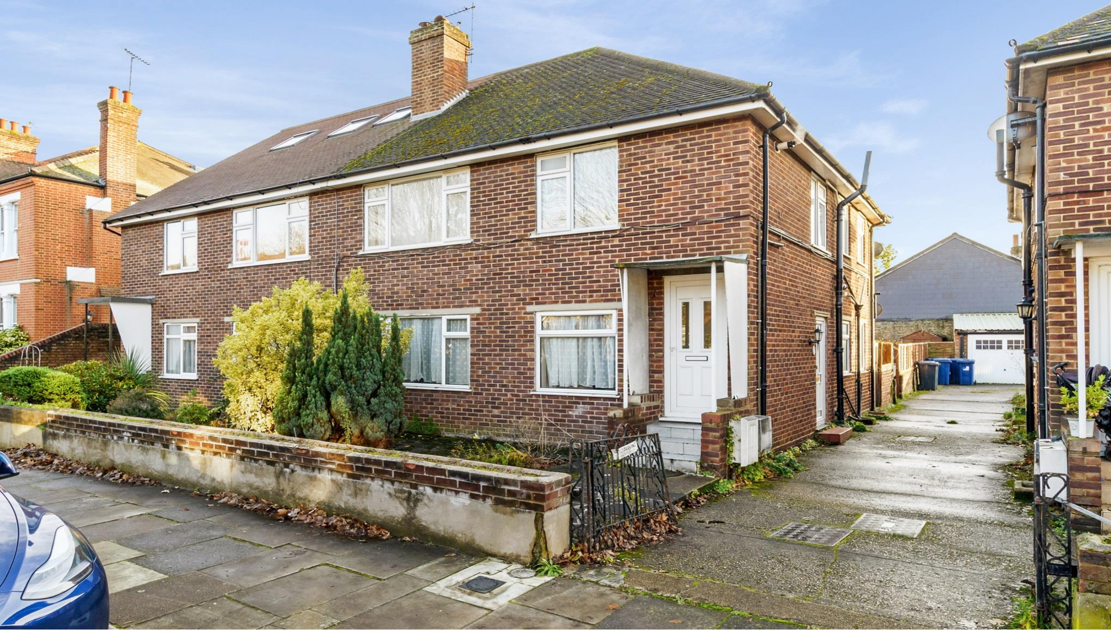
Webster Gardens, London, W5 5NB