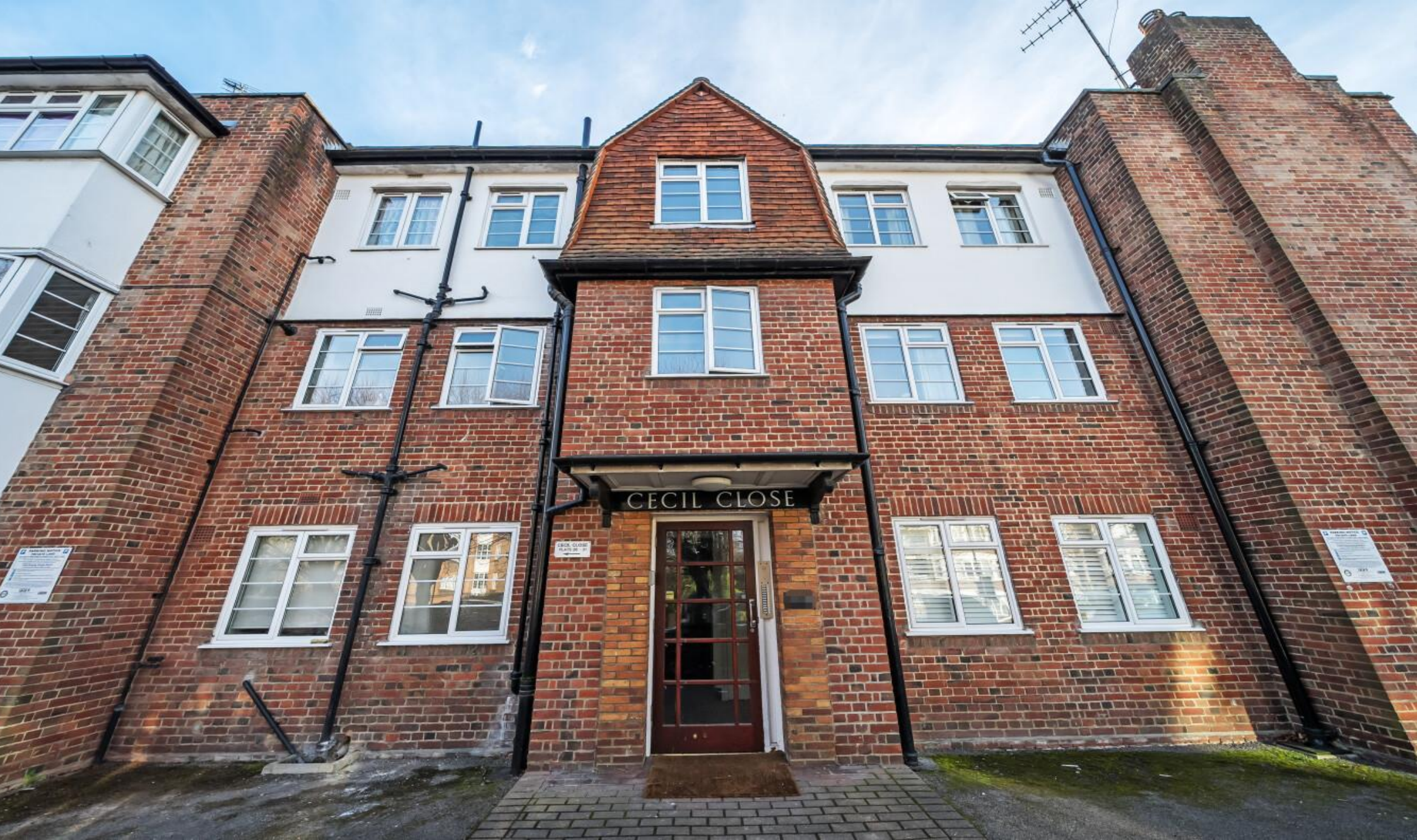
Cecil Close Mount Avenue, London W5 2RB