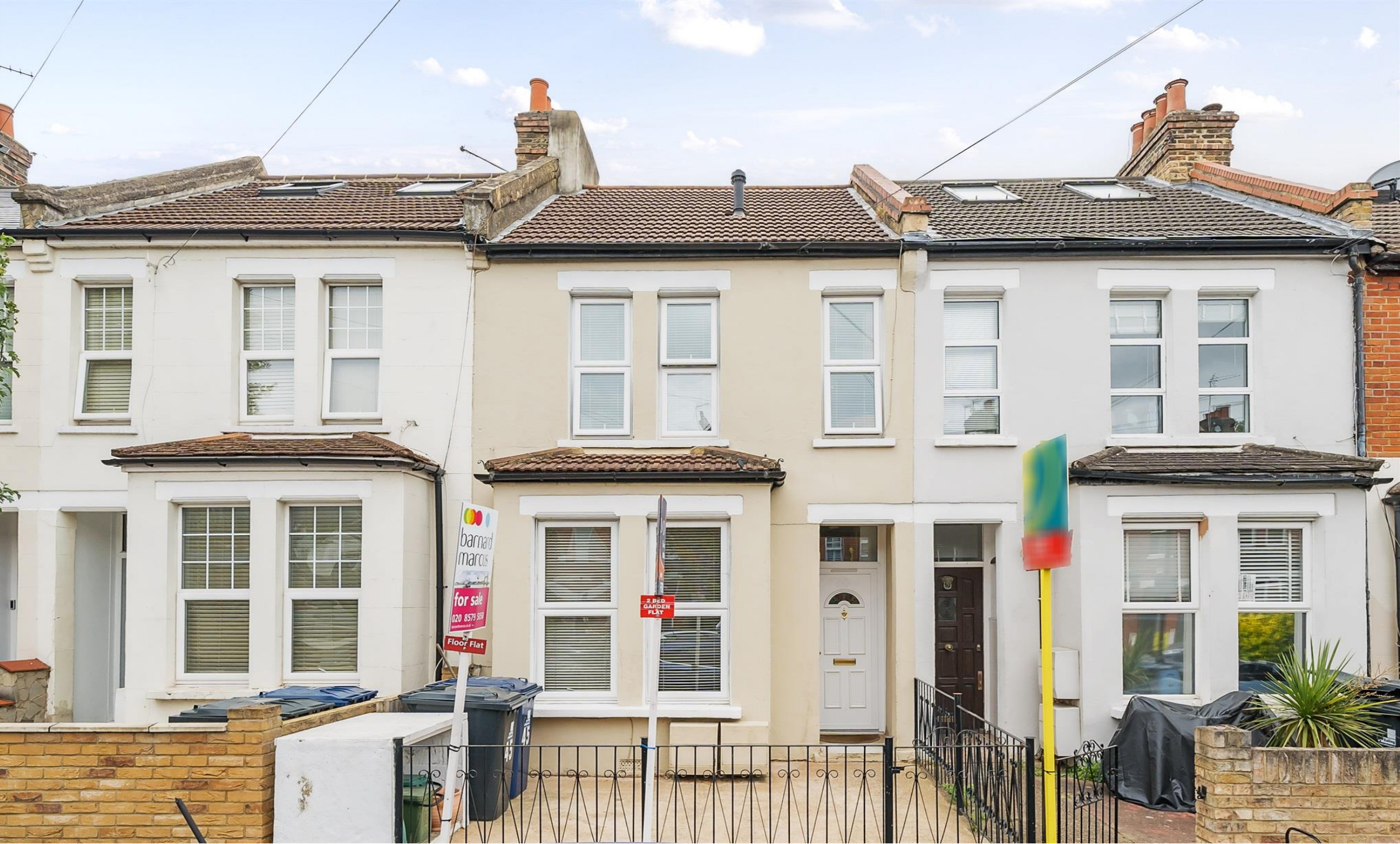
Ground Floor Flat, Connaught Road, London W13 0TF