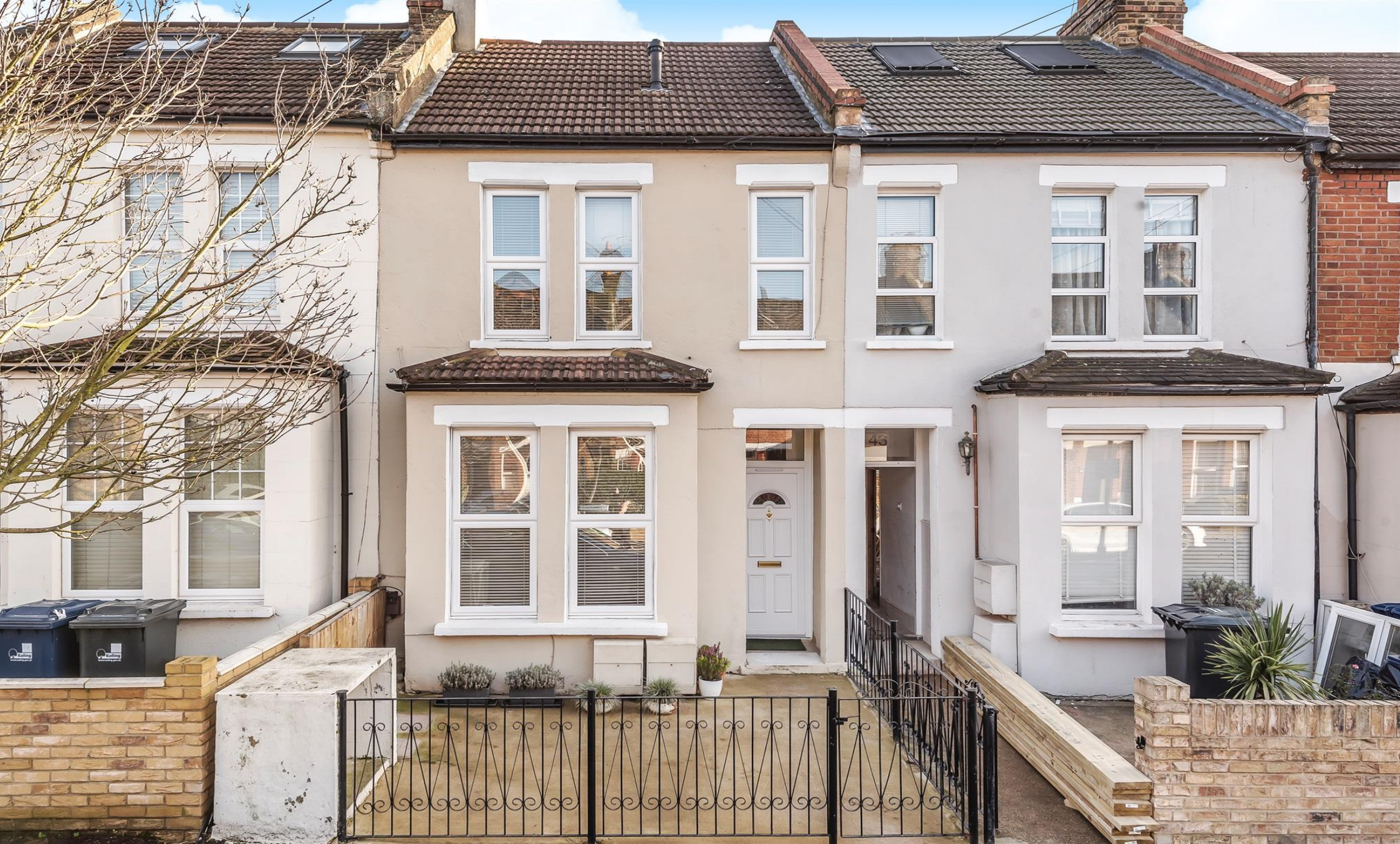
Connaught Road, London, W13 0TF