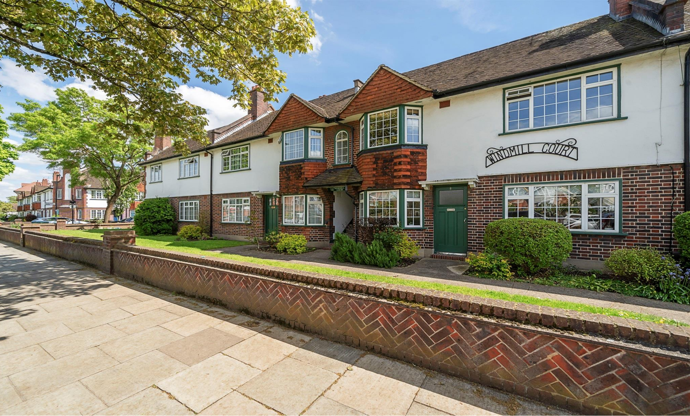
Windmill Court, Windmill Road, London, W5 4DN