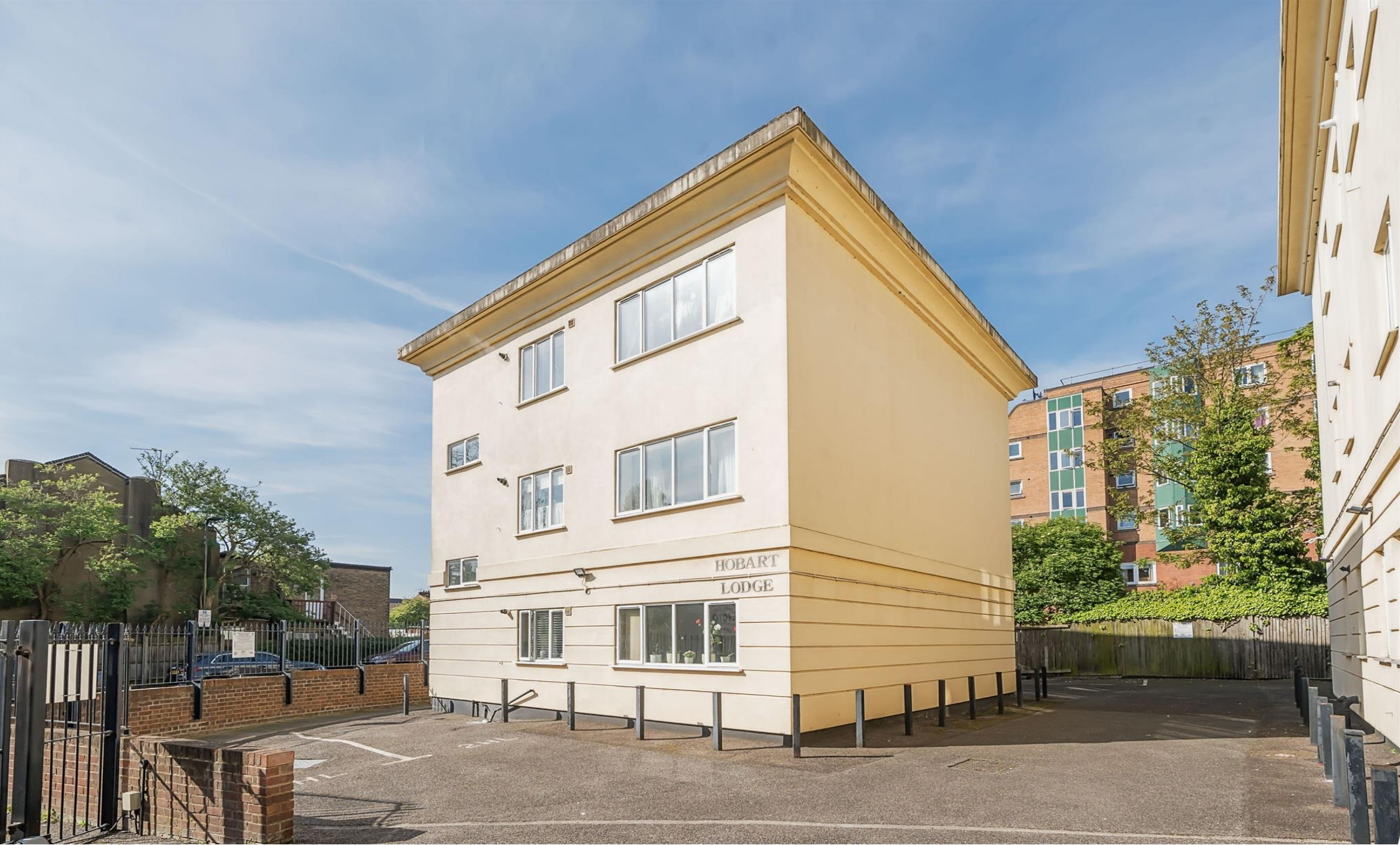
Hobart Lodge, Leeland Terrace, London, W13 9HW