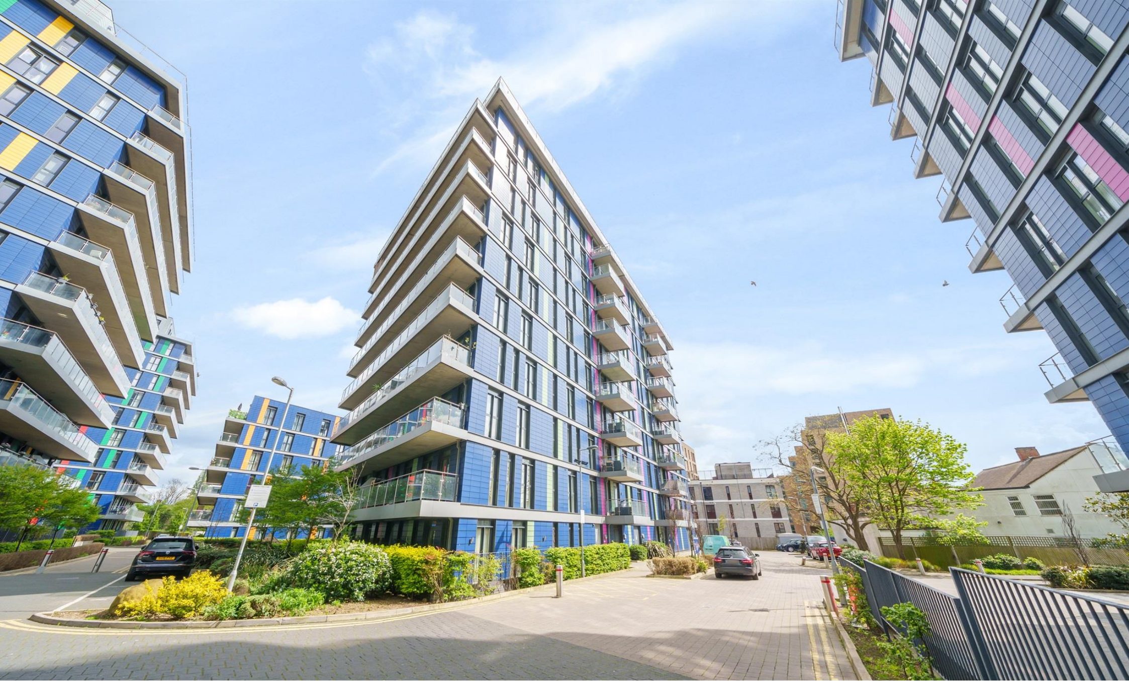
Braunston House, Hatton Road, Wembley, HA0 1RP