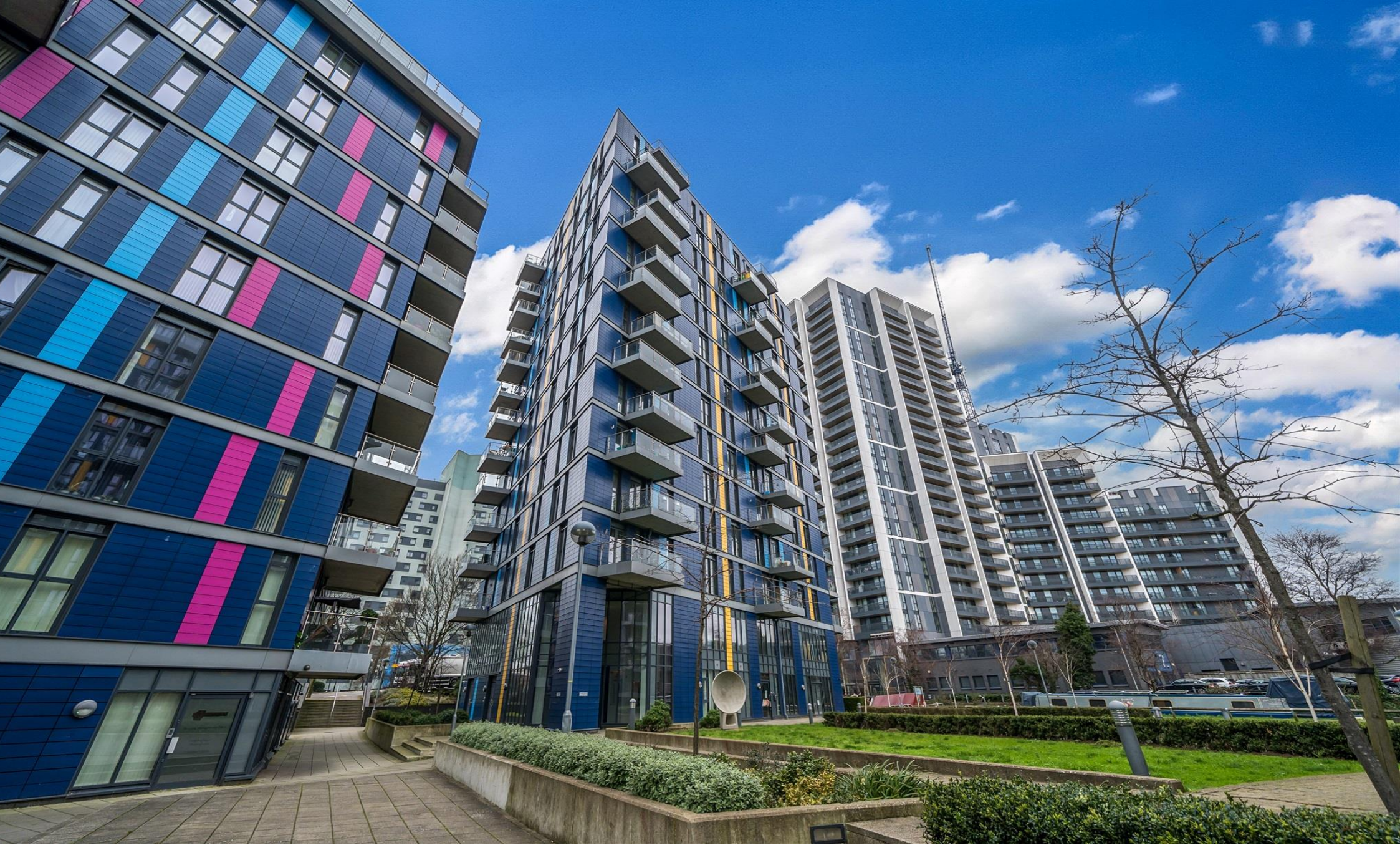
Venice House, Hatton Road, Wembley, HA0 1QL