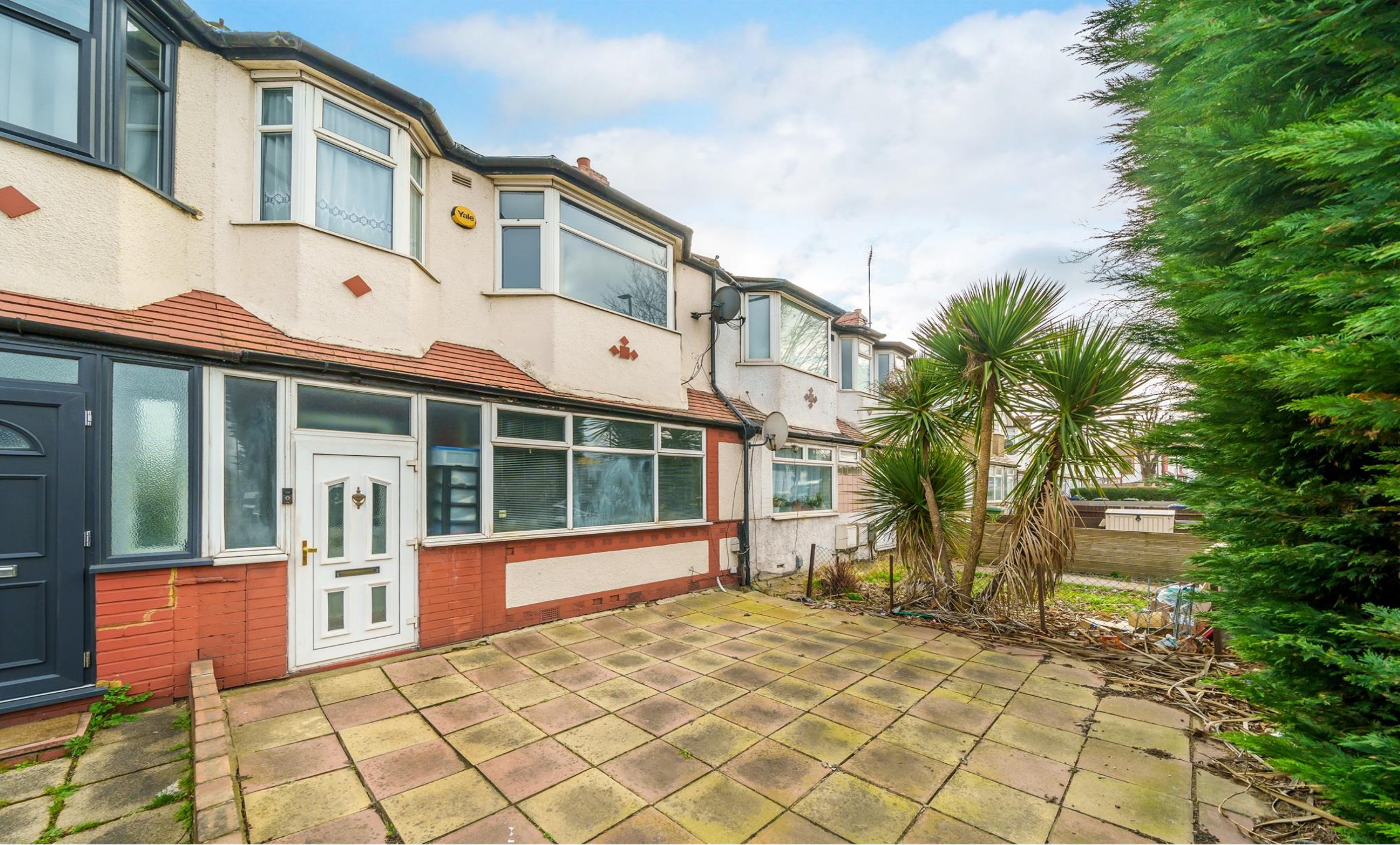
Priory Gardens, London, W5 1DX