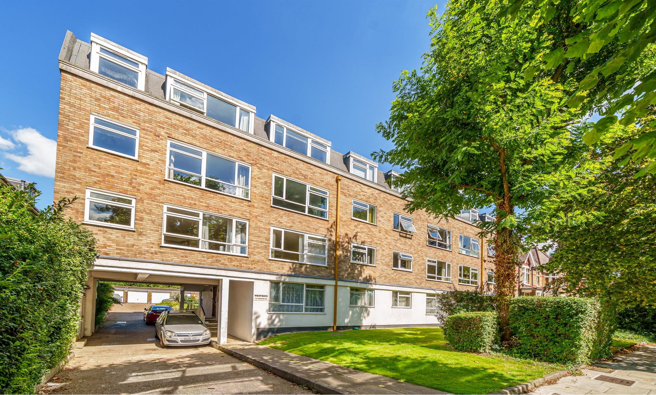
Westways, Hamilton Road, London, W5 2EE