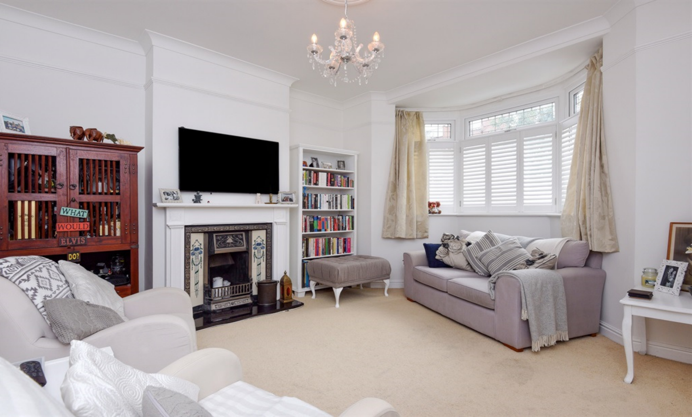
The Ground Floor Flat At Clyde Road, Croydon CR0 6SW