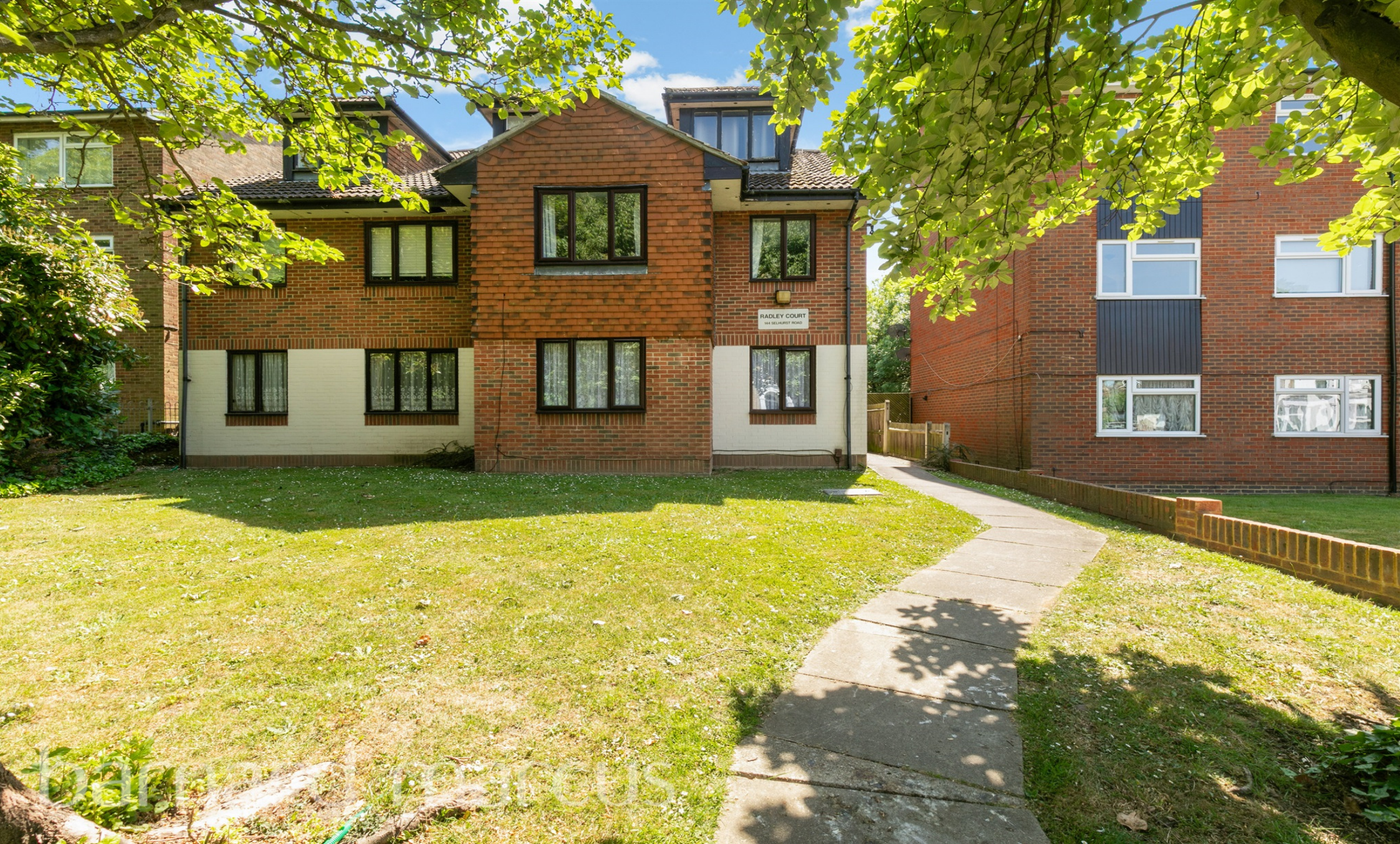
Radley Court Selhurst Road, London SE25 6LP