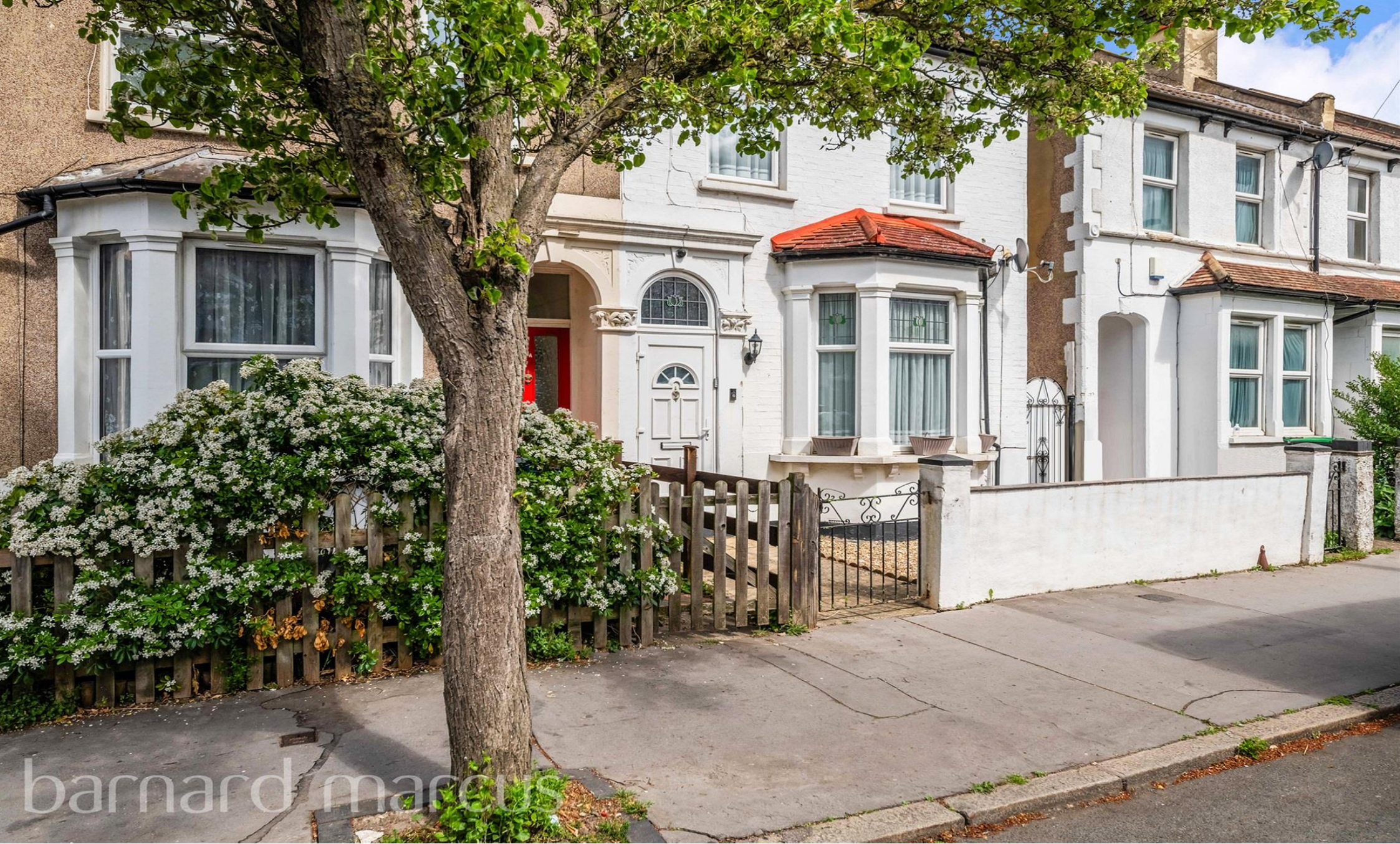
Limes Road,CROYDON CR0 2HF