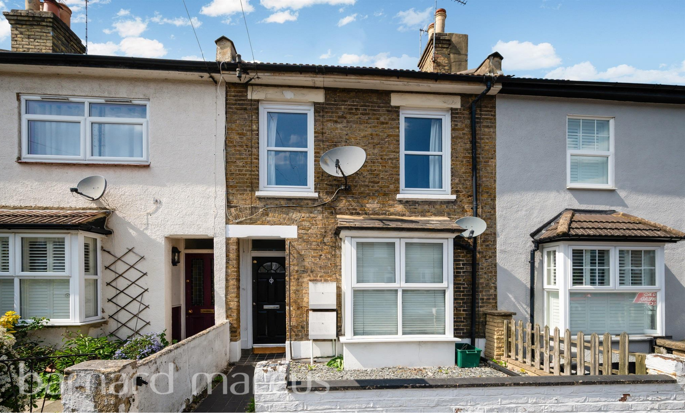
Kemble Road,Croydon CR0 4JQ