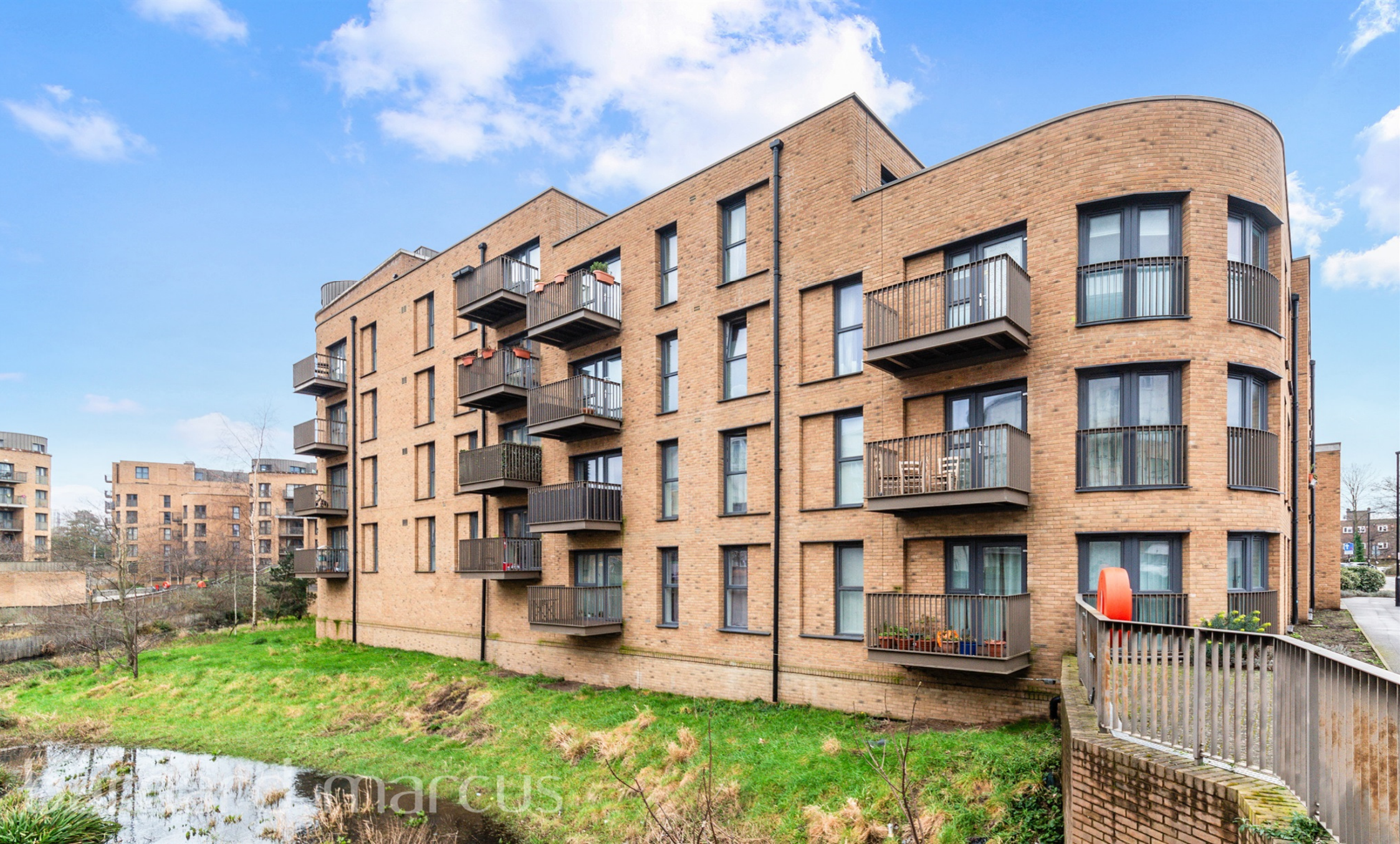
Palladian Court Cabot Close, Croydon CR0 4FP