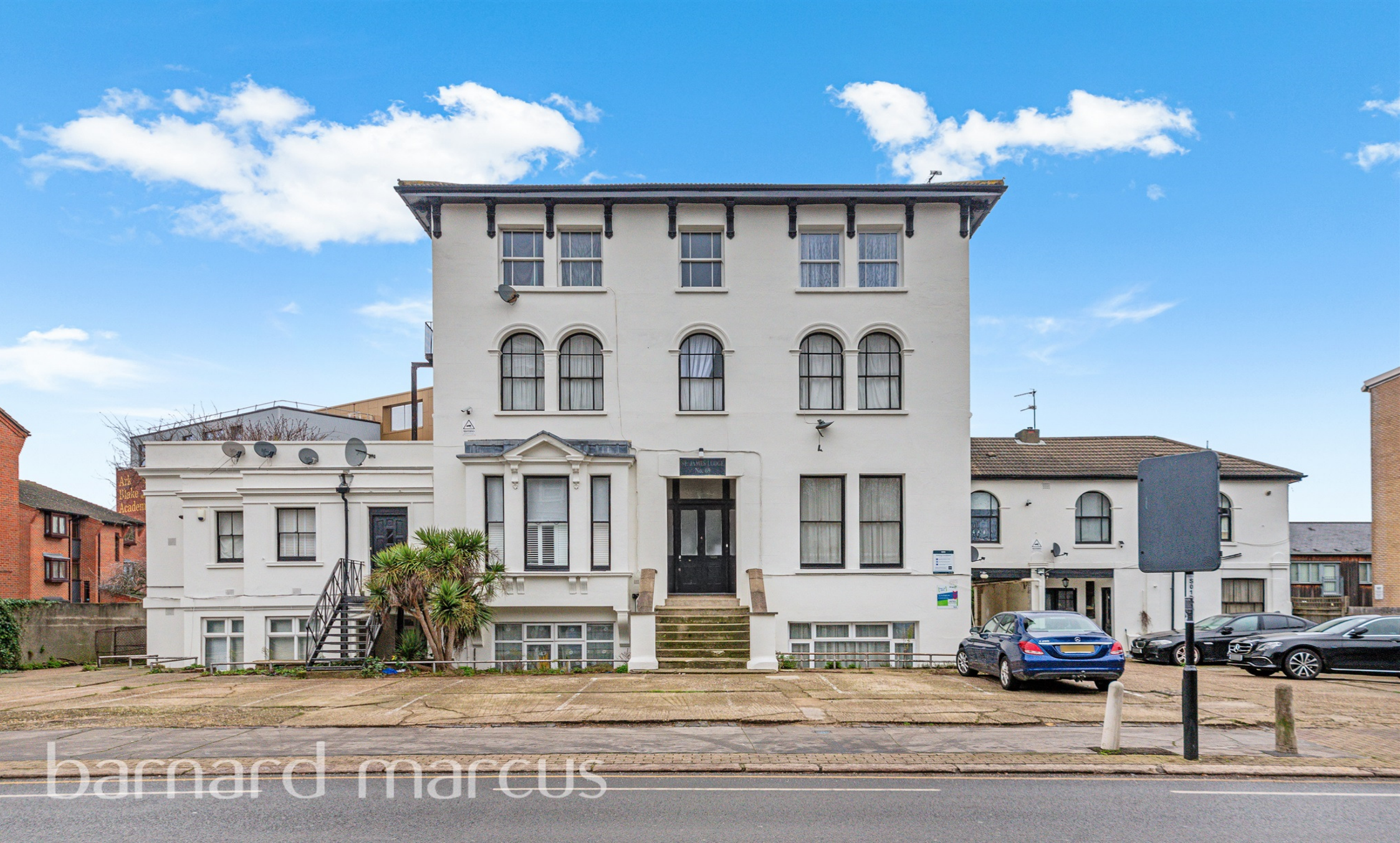
St. James's Lodge Lower Addiscombe Road, Croydon CR0 6PR