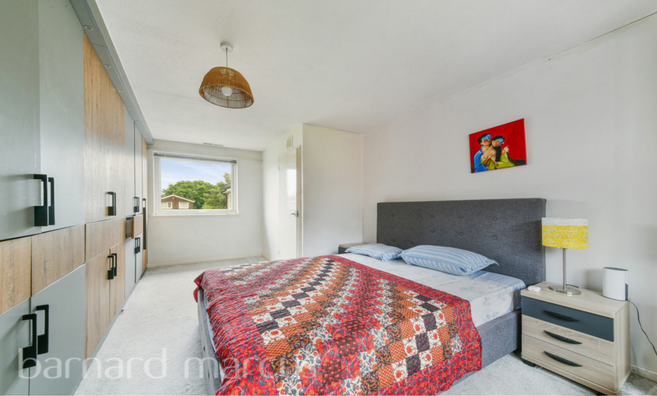
Crusader Gardens, CROYDON CR0 5UJ