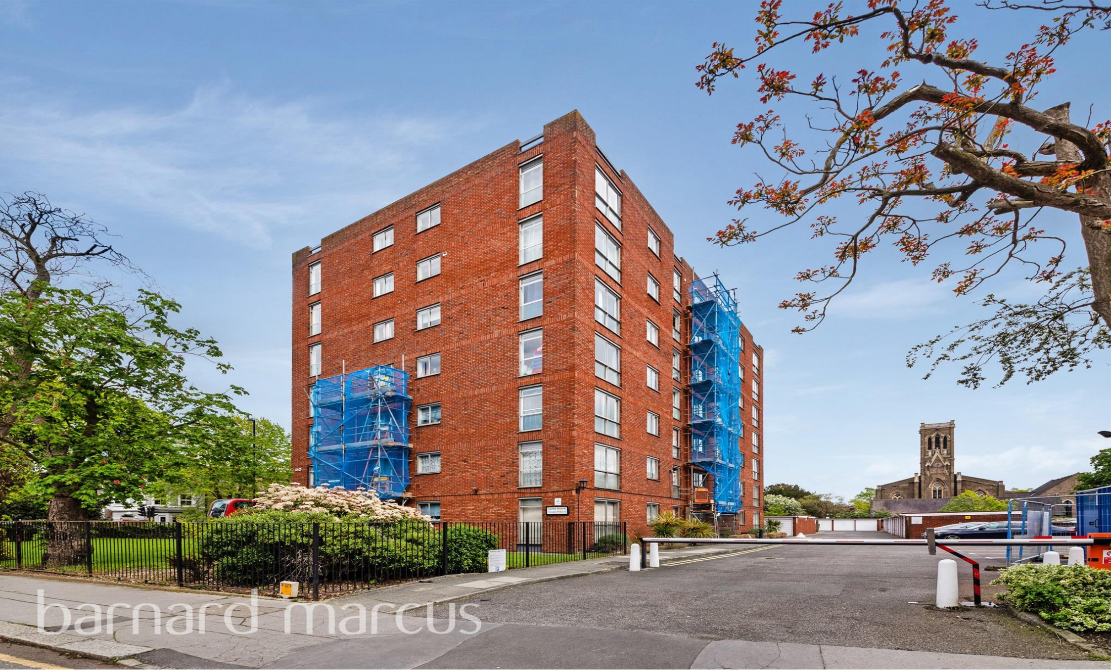
Lloyd House, Tavistock Road, Croydon CR0 2AN