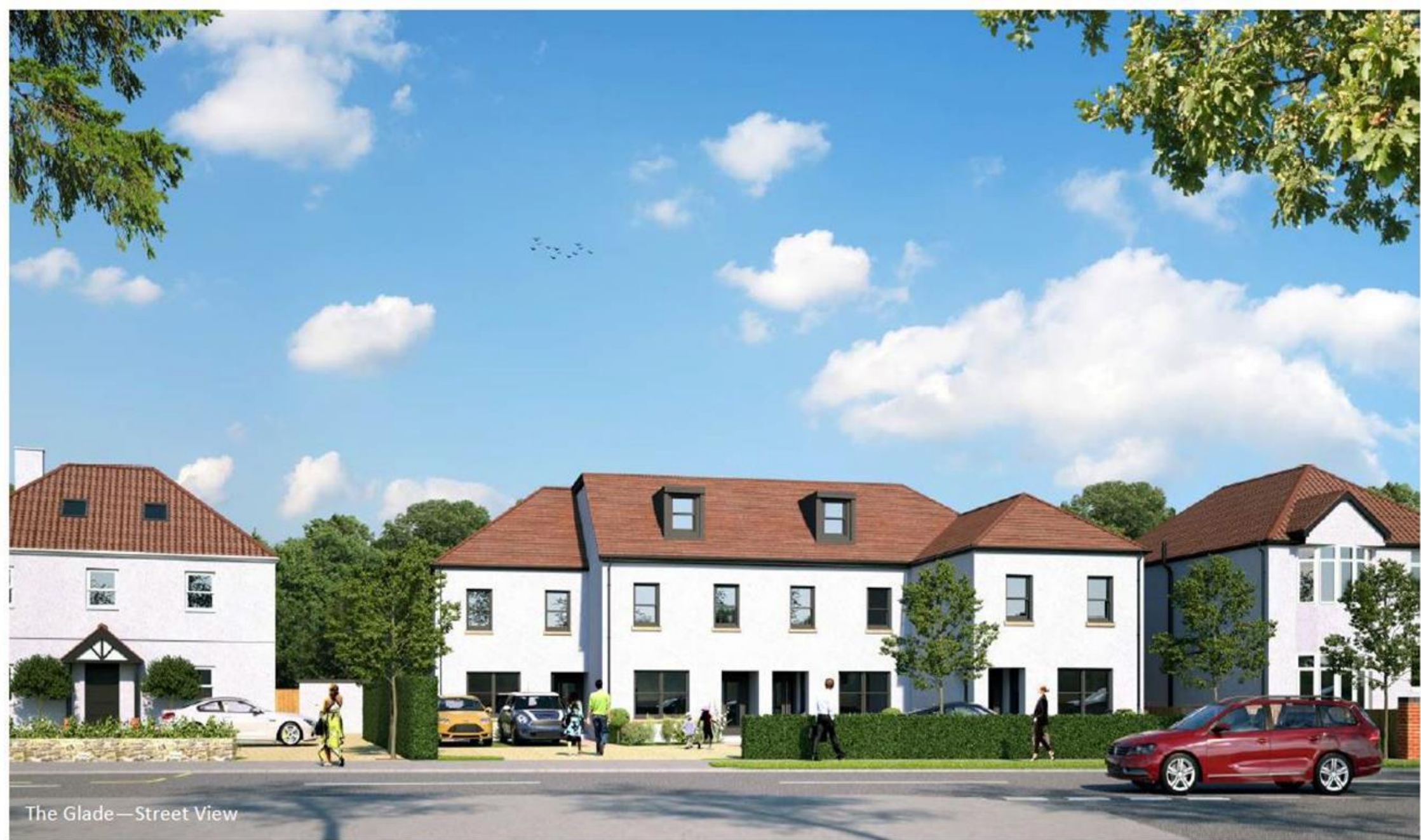
The Glade—Street View