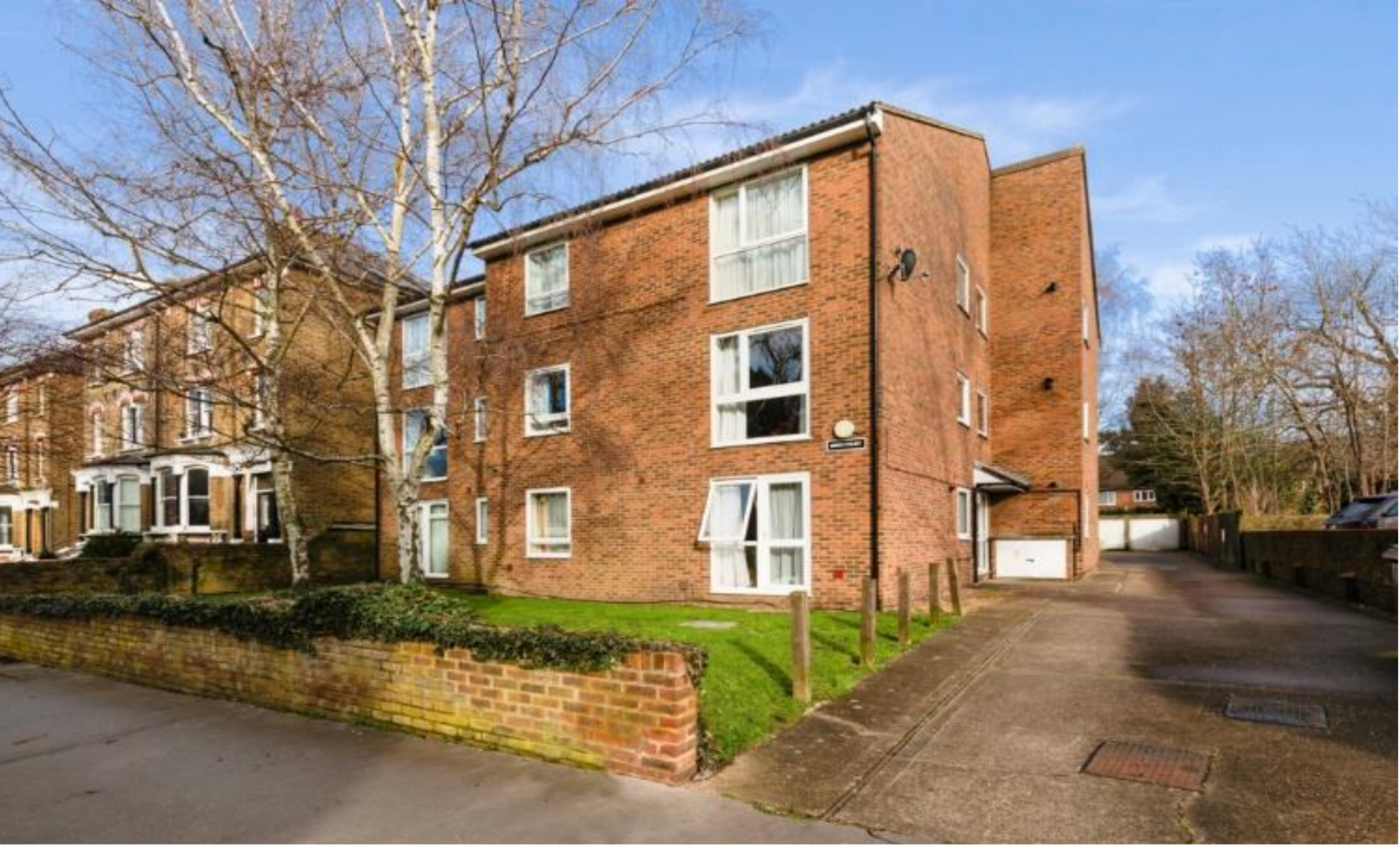
Birch Court, Canning Road, Croydon CR0 6QF