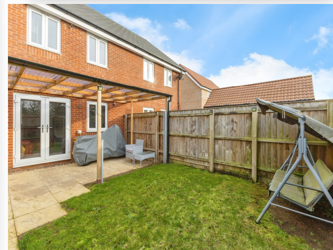
Hurricane Close, Attleborough, NR17 1GX