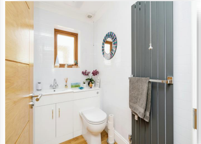
Hargham Road,Attleborough NR17 2ES