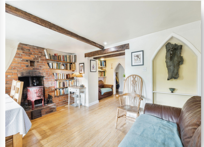
Fen Road, Old Buckenham, ATTLEBOROUGH, NR17 1NP