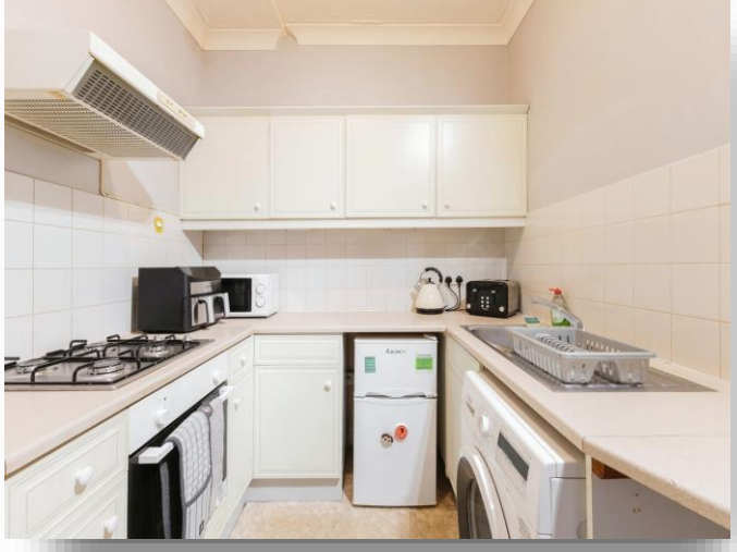
Hailey House London Road, Attleborough NR17 2DJ