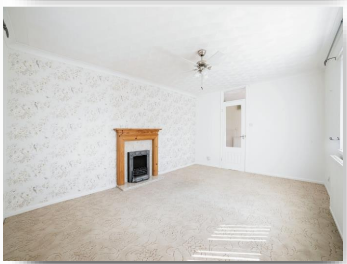
Edenside Drive, Attleborough NR17 2EL