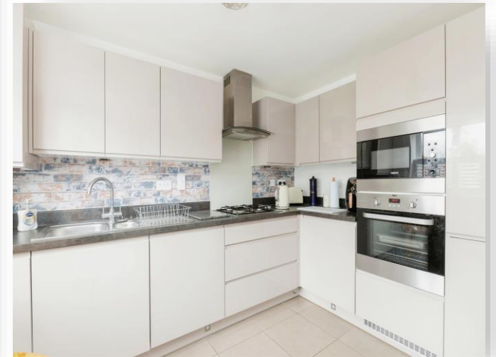
Tortoishell Drive, Attleborough NR17 1GU