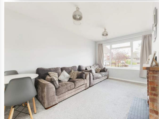
Leys Lane, ATTLEBOROUGH NR17 2HX