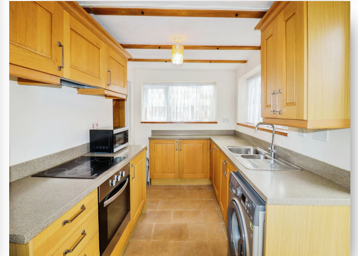
Hargham Road, Attleborough, NR17 2ER