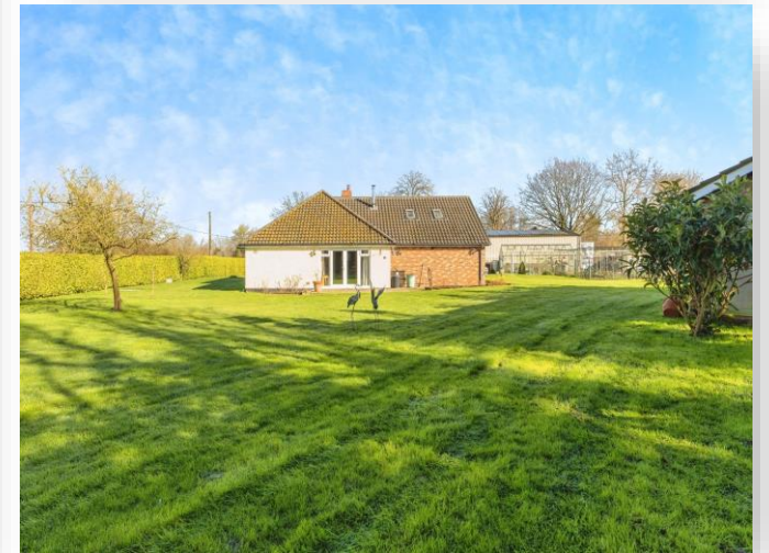
The Orchards Burgh Common, Attleborough NR17 1QF