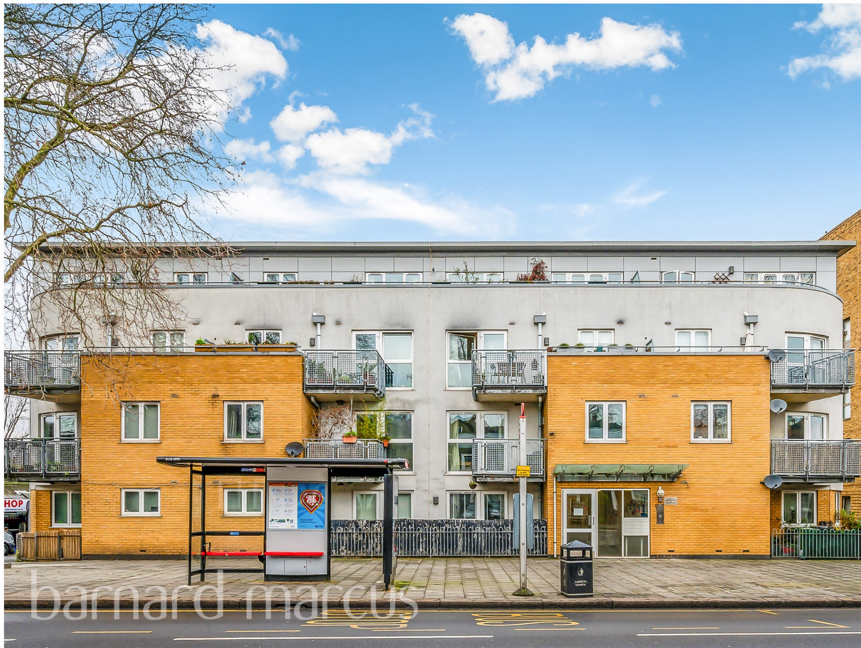
Brooklands Court Wandsworth Road, London SW8 3LX