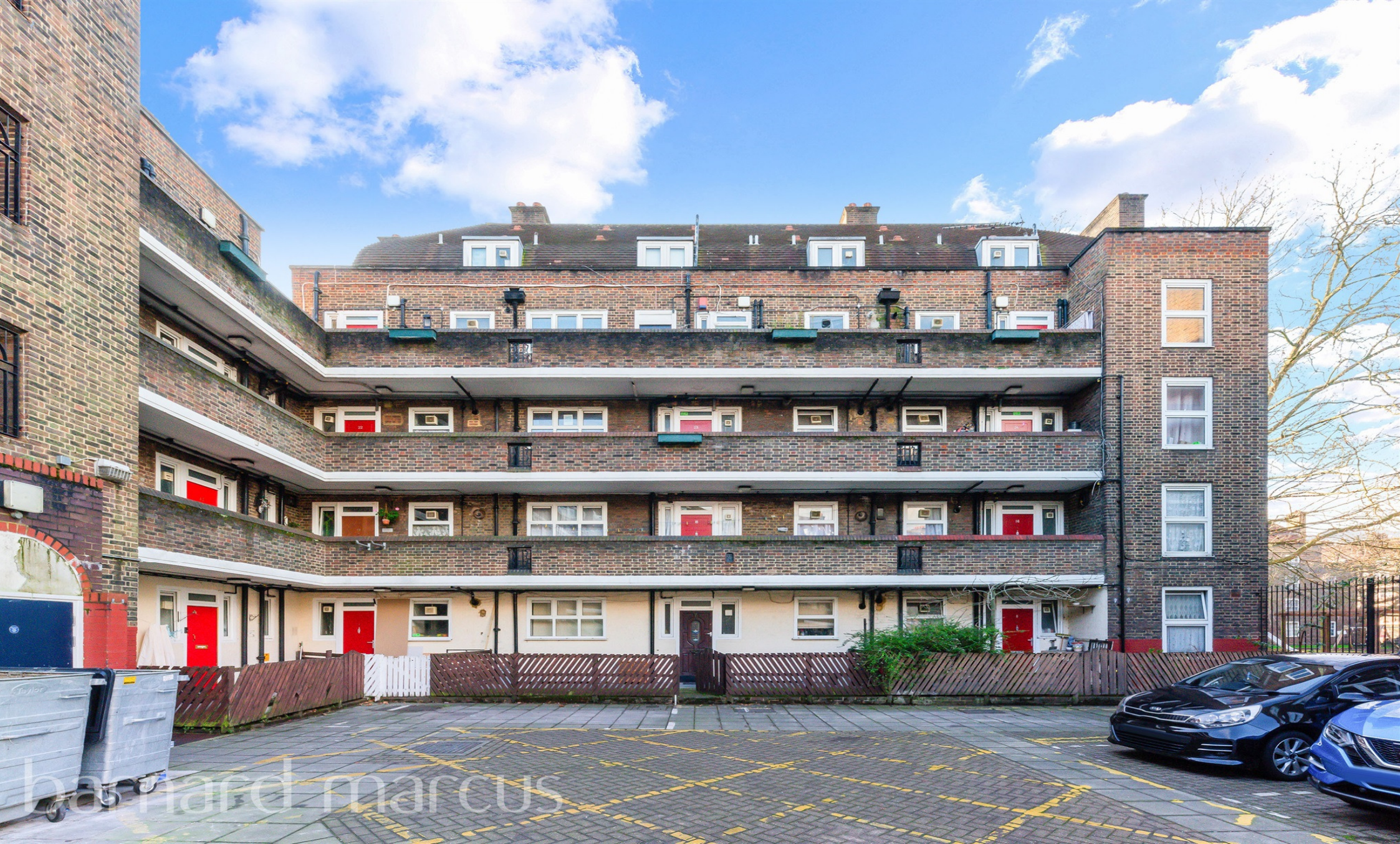
Kneller House Union Grove, London SW8 2RR

Not for marketing purposes INTERNAL USE ONLY