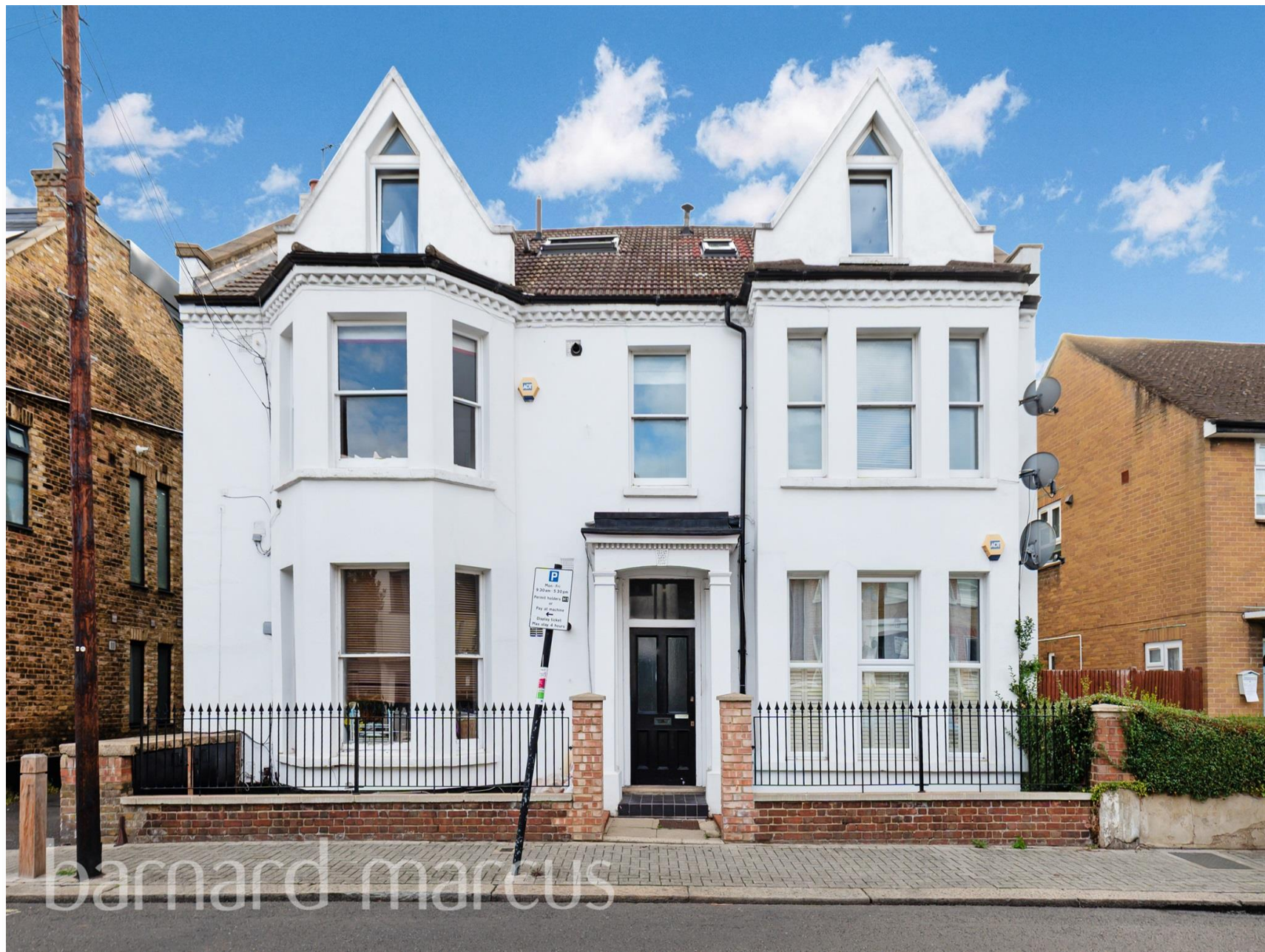
Alderbrook Road, London SW12 8AF