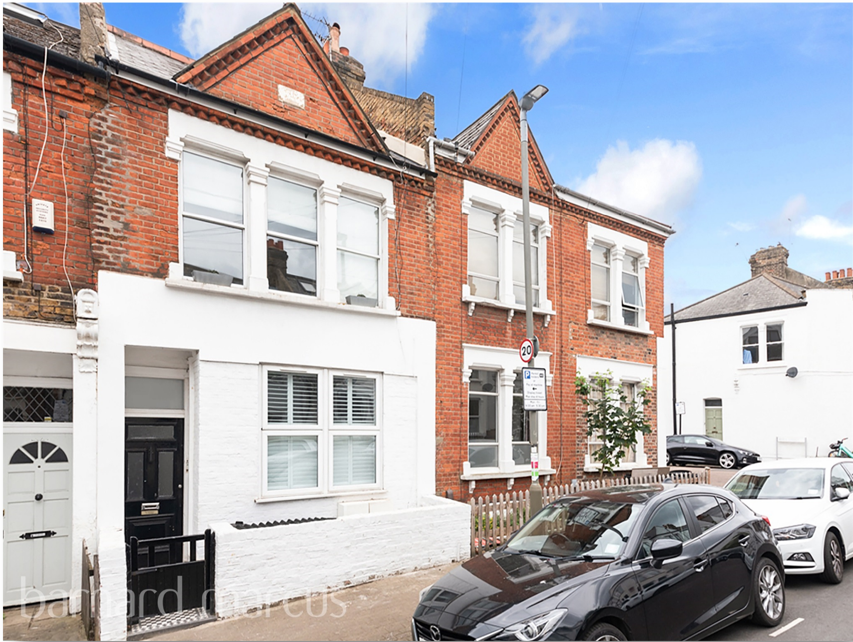
Dagnan Road, London SW12 9LQ